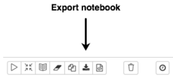
Figure 3.5. Zeppelin Export Icon