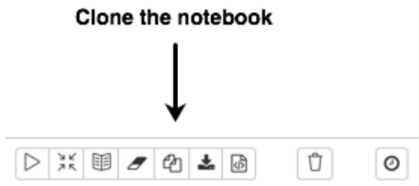
Figure 3.2. Zeppelin Clone Icon

Zeppelin displays a Clone note dialog box: